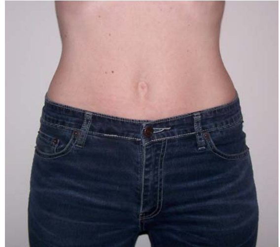
After 6 New Life Treatments (3 Weeks)