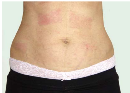
After 4 New Life Treatments (2 Weeks) Post Pregnancy Client