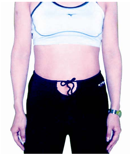
After 10 New Life Treatments (5 Weeks)