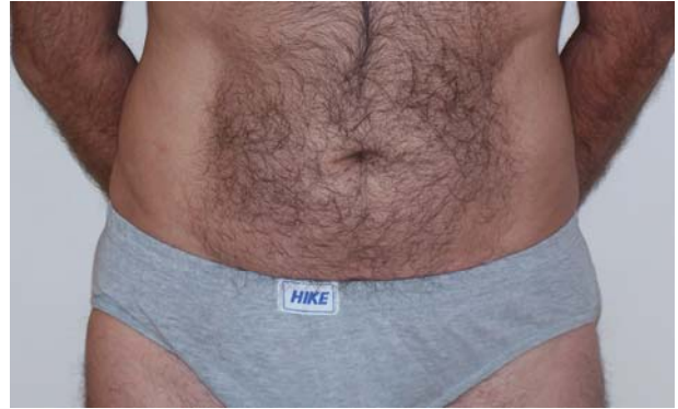
After 7 New Life Treatments (3 weeks)