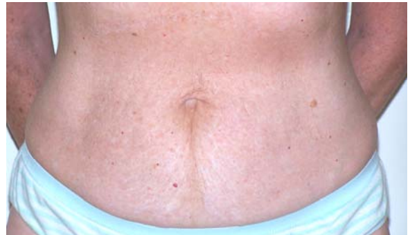
After 6 New Life Treatments (3 weeks)