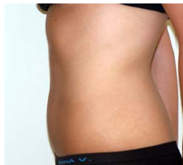
After 12 New Life Treatments (6 Weeks)